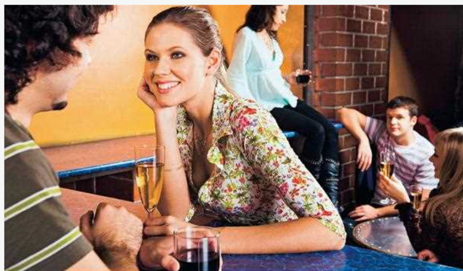
PheromonesAndrosteronePheromone ScentFavorite PerfumeMax