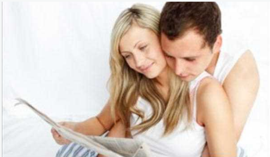
Liquid Pherones Strongest

There could difference between making something a priority and also having a good obsession. No one wants to be able to be the Captain Ahab of the dating world. Science shows all of us that eager individuals send out tense, actually poor information as pheromones; there can be good or bad pheromones. A pheromone is a released or excreted chemical factor that activates a social response in members of the same species.